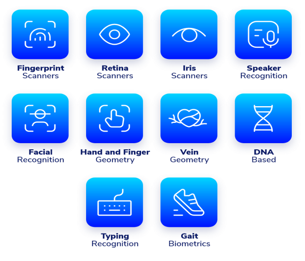
Fig:1 Biometric Access Control Systems

Technology Selection: Choose appropriate technologies and tools for implementing the biometric access control system. Select biometric recognition technologies (e.g., fingerprint recognition, facial recognition) based on the application requirements. Decide on programming languages, frameworks, databases, and development platforms.