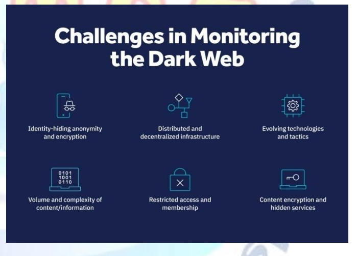
Fig 2: challenges Dark Web Monitoring

monitoring. Analysis of user-generated content on dark web forums, discussion boards, and marketplaces to understand trends in illicit activities and underground communities [4]. Examination of user perceptions of privacy, security, and anonymity on the dark web, including their trust in darknet markets and encrypted communication channels.Investigation of user engagement with dark web monitoring tools and services, including their preferences for features, interfaces, and data visualization techniques [5]. Legal and Regulatory Frameworks for Dark Web Monitoring: A Global Perspective Sarah Garcia Overview of international laws, treaties, and conventions relevant to dark web monitoring and cybersecurity [7].Comparative analysis of legal frameworks in different jurisdictions regarding data collection, surveillance, and evidence gathering on the dark web.Examination of court rulings and legislative debates shaping the legality and scope of dark web monitoring activities by government agencies and private entities [6].