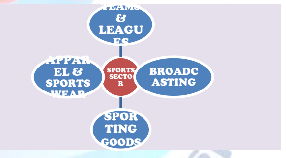
Fig.-3: make-up of the sports sector (as defined in this report)

• Apparel and sportswear: The sportswear industry, including manufacturers of clothing, footwear, and apparel.