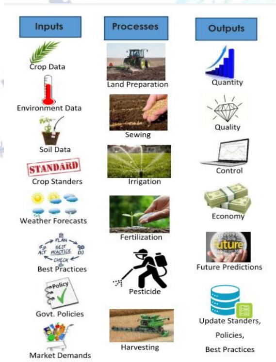
Figure 2. Some key inputs, processes involved and possible outputs of smart farming

spatial patterns of nutrients conditions with a better delicacy and minimal labor conditions. The Normalized Difference Vegetation Index (NDVI) (Benincasa et al, 2018) uses upstanding/satellite filmland to assess crop nutrient status. NDVI may be a dimension of crop health, foliage vigor, and viscosity that is supported the reflection of visible and near-infrared light from foliage. It also helps to probe soil nutrient situations. Similar exact prosecution can vastly boost toxin effectiveness while also reducing environmental side goods. Numerous new enabling technologies, like GPS delicacy (Shi J et al, 2017), geo mapping (Suradhaniwar et al, 2018), Variable Rate Technology (VRT) (Colaco and Molin, 2017), and independent vehicles, are making a big donation to IoT- grounded smart fertilization.