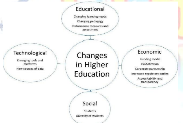
Fig. 1. Big Data Analytics in Education Sector

Education institutes deliver substantial volume of information which should be dissected to maintain in such an competitive environment. These associations need portrayed strategy to break down their information for the advancement their learning and scholastic exercises. Education institutes may have diverse measurement of Big Data analytics as appeared in figure.