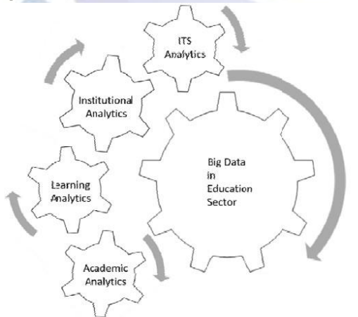
Figure – 3: Components of Big Data Analytics in Education Sector

Big Data analytics results guarantees that some important choice can be removed from the efforts deployed on huge amount of data. Actionable information can be gathered or expected as a result of this analytics. As of late, big data analytics influence higher education practice at a very high extent to achieve effective and evidencebased strategic decision making [8]. Big Data settles on basic leadership process practical by utilization of a précised proposed structure model [8]. Segments of Big Data are appeared in the below figure[8].