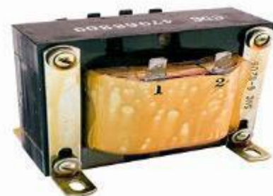
Fig 4 Transformer

A Transformers are used to change AC voltage levels, such transformers being termed step-up or step-down type to increase or decrease voltage level, respectively. Transformers can also be used to provide galvanic isolation between circuits as well as to couple stages of signal-processing circuits. Transformers have become essential for the transmission, distribution, and utilization of alternating current electric power.