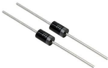
Fig 6 Diode

This is a two-terminal electronic component that conducts electricity primarily in one direction. It has high resistance on one end and low resistance on the other end. It has two terminals – Cathode and Anode