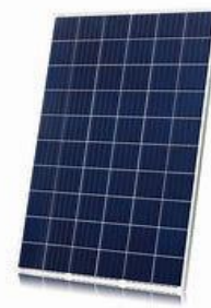
Fig.2 Solar Panel

Selecting a suitable and more importantly an affordable Solar panel has become quite understandable these days as cost-effectiveness is one of the most major concerns. Here, the solar panel is basically poly-crystalline due to its subtle yet effective advantageous uses. It traps sunlight in the daytime and once photo receptors on its surface give a signal that there is no sunlight left to receive, it starts sending power to the further parts of circuit in order to illuminate the path with the help of LED bulbs in series forming an entire Street-light.