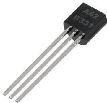
Fig 5 Transistor

Transistor is basically a semiconductor device that can be used in both ways, to act as a switch as well as an amplifier. It can conduct & insulate both current and voltage as per requirement. P-N-P type is used here as it is widely used as a switch, just like in this case.